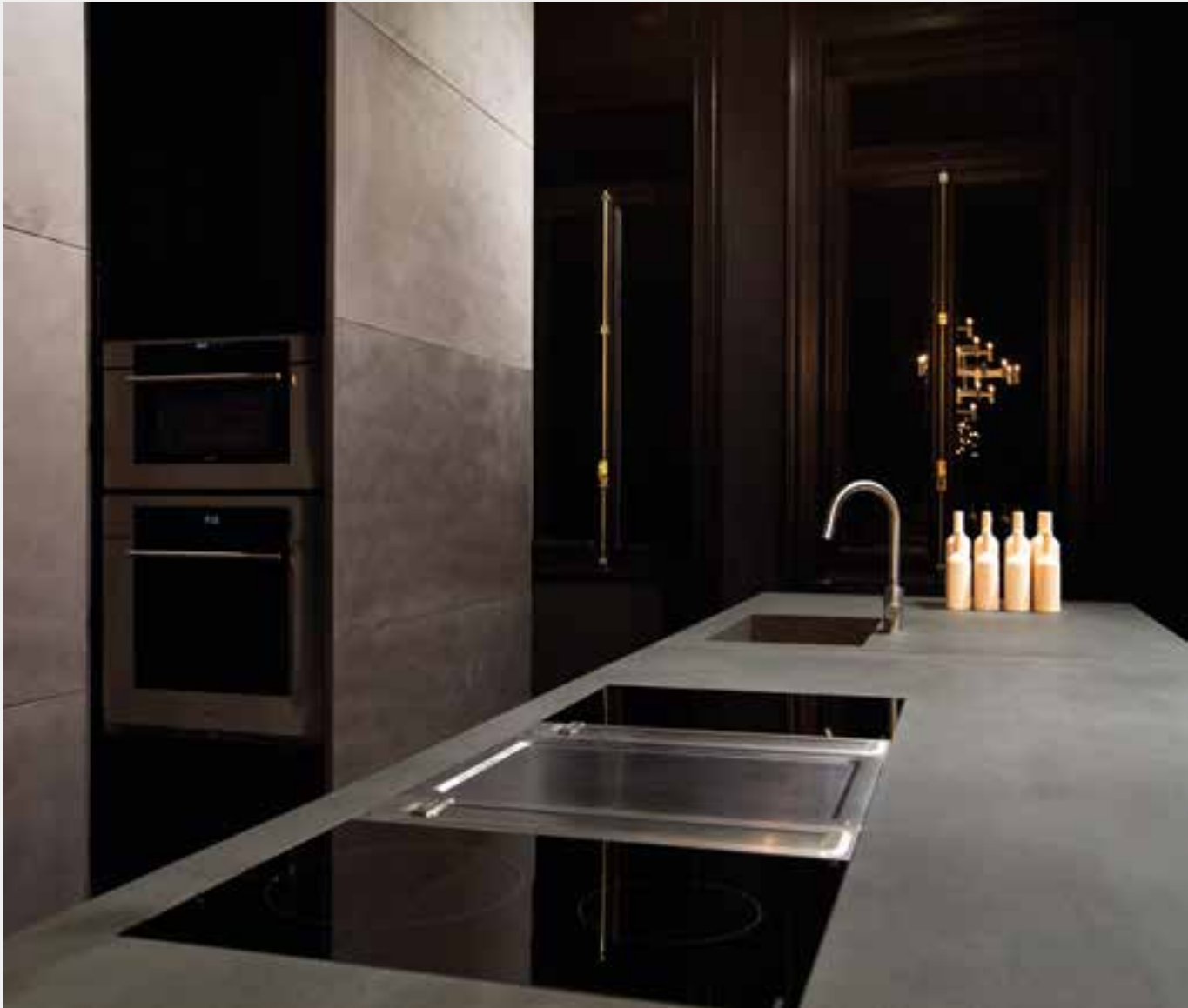
Rifra ▶ Year: 2017 Kitchen One Kitchen Doors Laminam3+ Calce, Nero 1000x3000 Countertop Laminam 12+ Calce, Nero 1620x3240