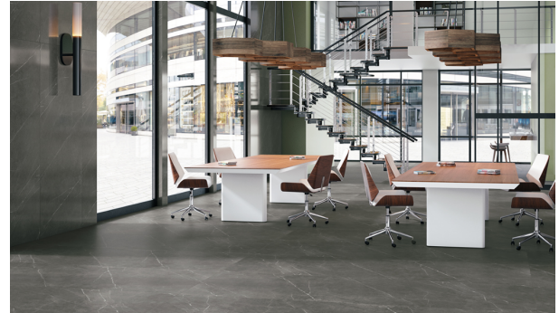
Crossville's versatile, innovative Porcelain Tile Panels may be installed in ways and on surfaces previously unthinkable for tile in architectural design.