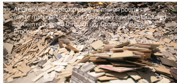
At Crossville, approximately 12 million pounds of waste material that would previously have been landfilled has been recovered through our Crossville Recycling Processes™.

* Recycled content is the same for both UPS and SPO finishes