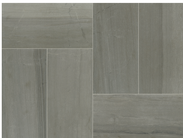
AV305 ▶ Apollo HON