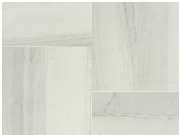
AV302 ▶ Luna HON