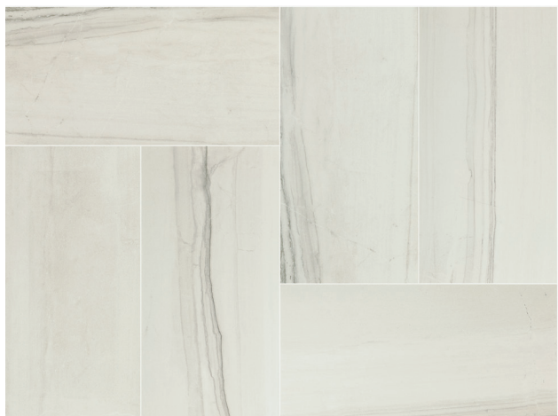
AV302 ▶ Luna UPS