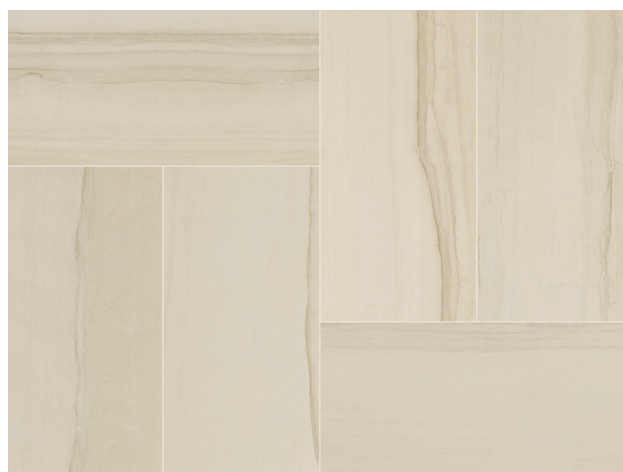
AV303 ▶ Kosmos HON