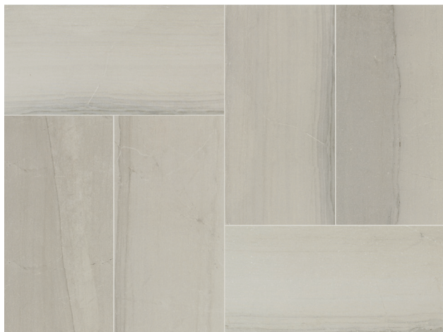
AV304 ▶ Gemini UPS