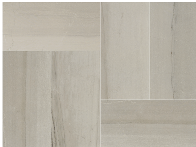
AV304 ▶ Gemini HON