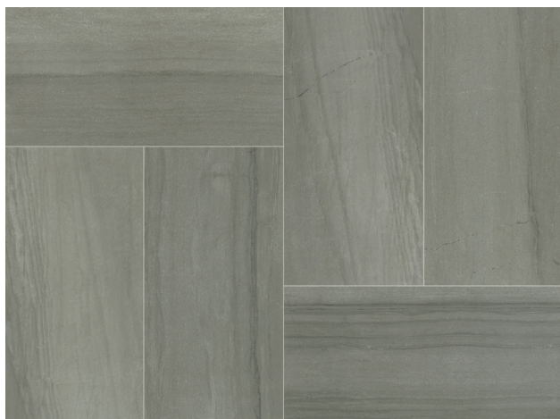
AV305 ▶ Apollo UPS