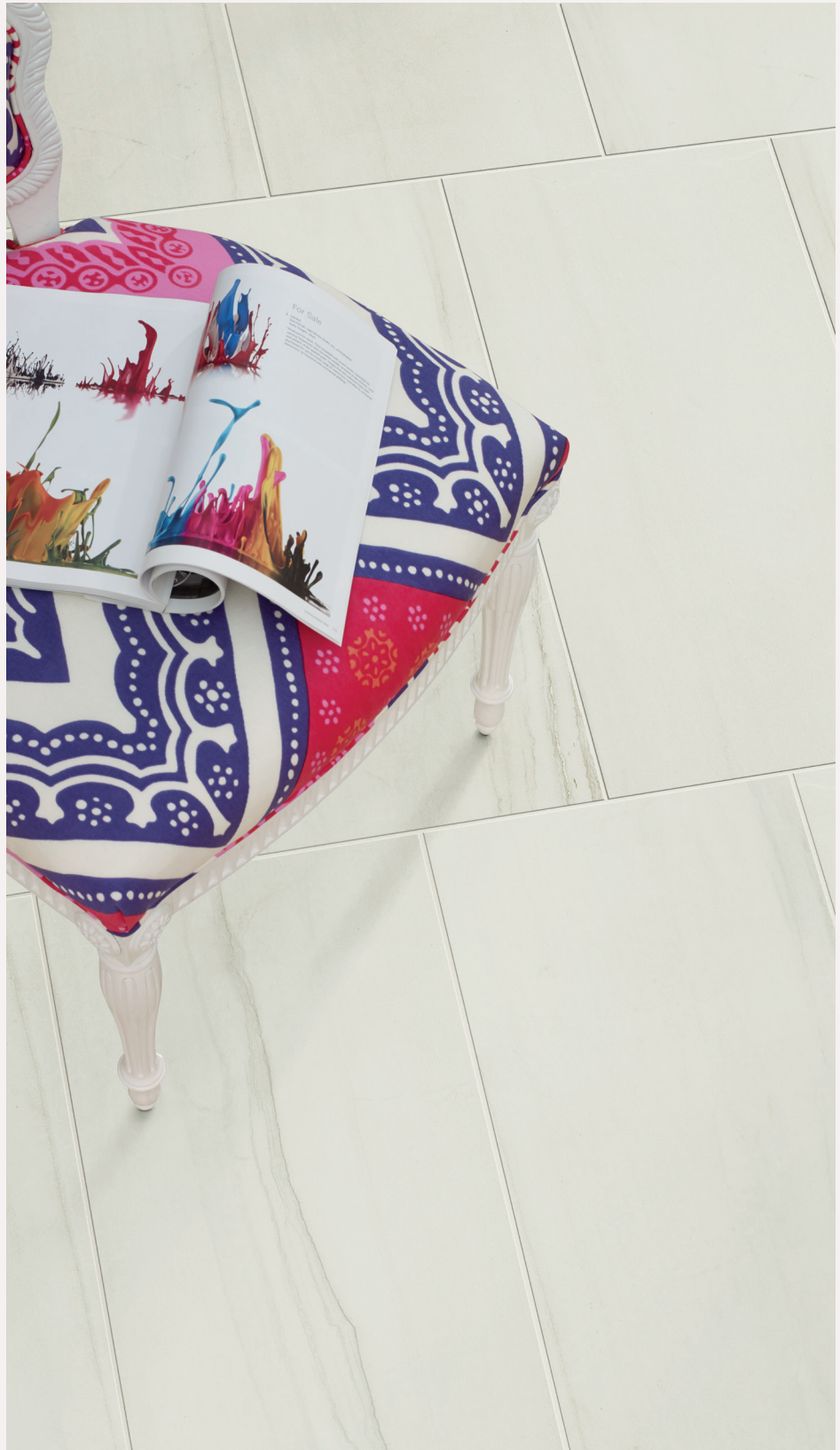
AV302 ▶ Luna 18 x 36 UPS