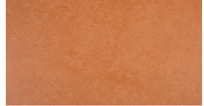
ARG10 ▶ Orange Crush UPS