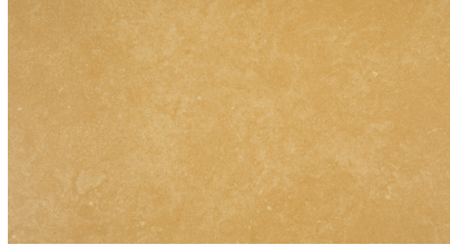
ARG09 ▶ Lemon Drop UPS