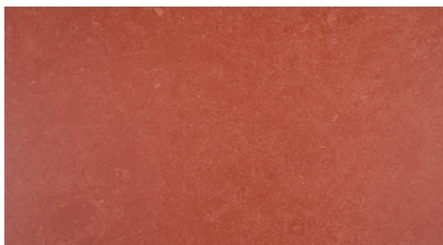
ARG12 ▶ Chicago Fire UPS