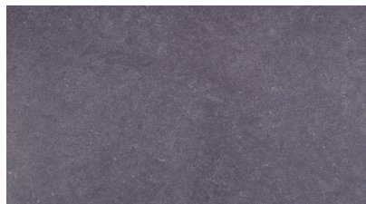
ARG16 ▶ Grapes of Wrath UPS