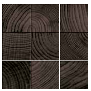
CON05 ▶ Orchid