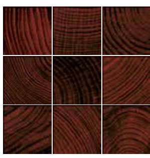
CON07 ▶ Currant