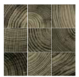
4 x 4 Mosaics UPS Finish (Mounted on an 298 x 298 sheet.)