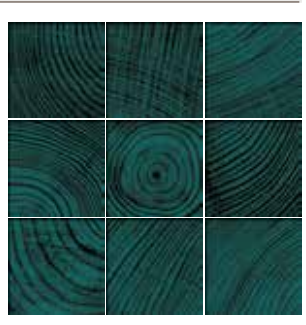
CONO8 ▶ Peacock