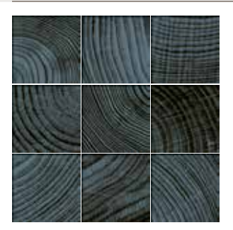
CON06 ▶ Indigo