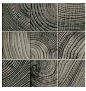
CON04 ▶ Pigeon