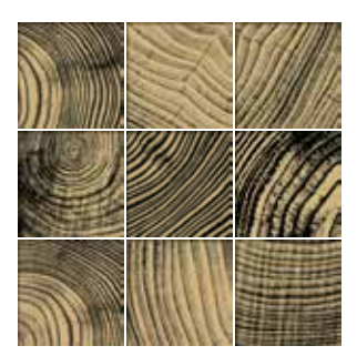
CON02 ▶ Chardonnay