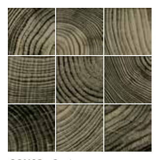
CONO3 ▶ Sepia