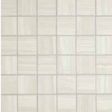
JAV01 ▶ Two Sugars 2 x 2 Mosaics