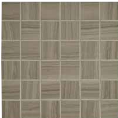
JAV04 ▶ Fresh Ground 2 x 2 Mosaics