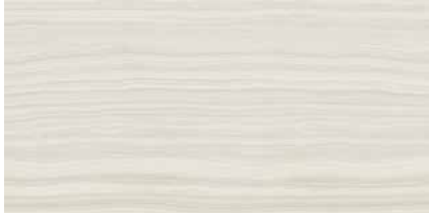
JAV01 ▶ Two Sugars