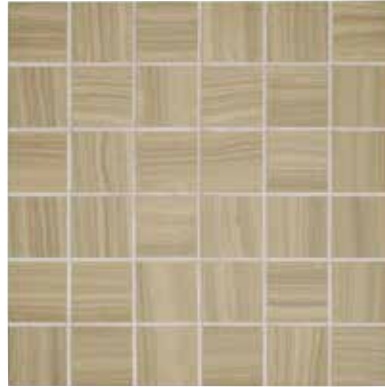
JAV02 ▶ Flat White 2 x 2 Mosaics