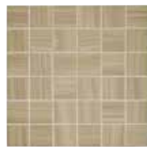
2 x 2 Mosaics UPS Finish (Mounted on an 12 x 12 sheet.)