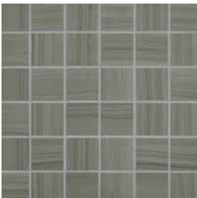
JAV05 ▶ French Press 2 x 2 Mosaics