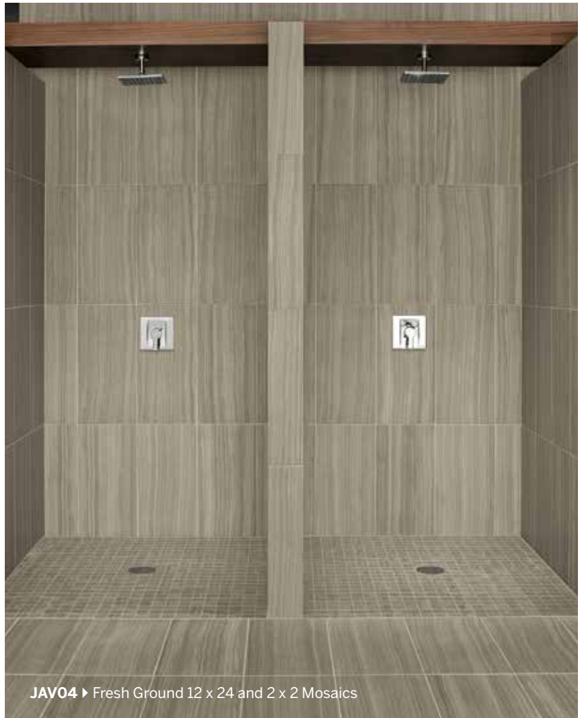
JAV04 ▶ Fresh Ground 12 x 24 and 2 x 2 Mosaics