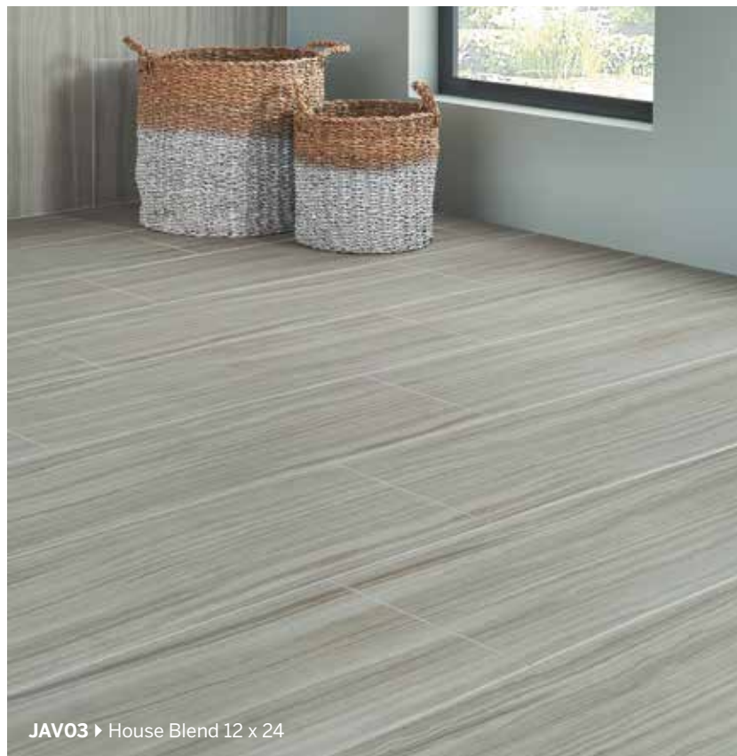
JAV03 ▶ House Blend 12 x 24

If you want a better idea of what Crossville tile would look like in a particular room setting, simply visit our website and click on Cross-Vision. This powerful software tool allows you to visualize different types of Crossville tile. In addition, you'll find comprehensive information about Crossville's entire portfolio of products. You can also learn about the latest styles and trends from industry experts, download detailed care and maintenance instructions for our various products, or browse electronic versions of Crossville's product brochures. So whether you need information about Crossville products or tile in general, please visit us at CrossvilleInc.com .