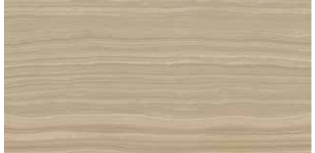
JAV02 ▶ Flat White