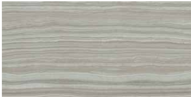
JAV03 ▶ House Blend