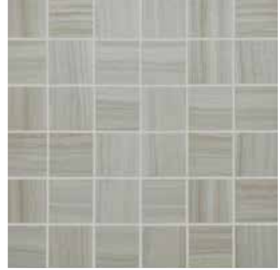
JAV03 ▶ House Blend 2 x 2 Mosaics