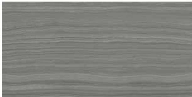
JAV05 ▶ French Press