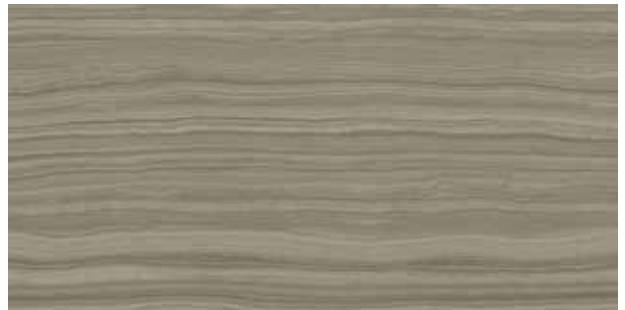
JAV04 ▶ Fresh Ground