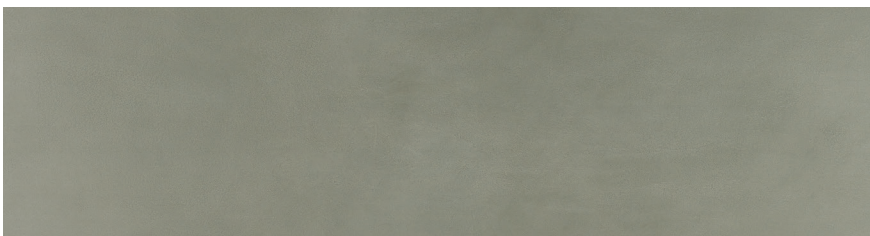
Tortora - F6382 - 3+ (Walls) - Stocking