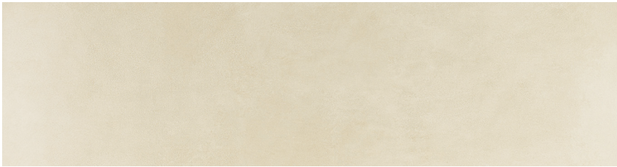
Bianco - F6385 - 3+ (Walls) - Stocking

Neutral colors and delicate nuances mark the face of Calce, a line inspired by wet plaster and concrete. The combination results in a soft, chalky visual that is both sophisticated and thoroughly contemporary.