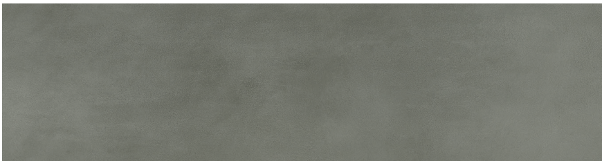
Antracite - F6373 - 3+ (Walls)- Stocking