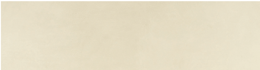
Avorio - F6372 - 3+ (Walls) - Stocking