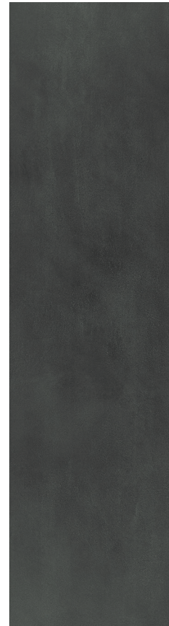
Nero - F6379 - 3+ (Walls) - Stocking

Note! These samples depict base color and sheen. Please refer to our website for a more accurate depiction of veining and pattern.