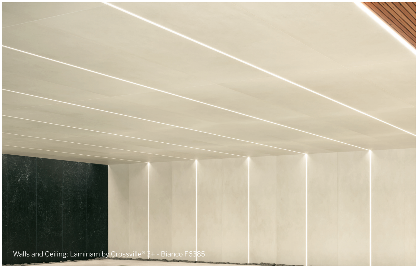
Walls and Ceiling: Laminam by Crossville® 3+ - Bianco F6385