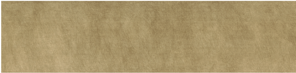
Oro - F7467 - 3+ (Walls) - Stocking

Silk - such a luxurious and time-honored fabric - is the inspiration for Crossville's new Seta line of large format porcelain panels. A glance quickly reveals delicate strands weaving through the surface visual. Perfectly dressy, but equally casual, these 1mx3m panels are high fashion. But make no mistake, as captivating as Seta is, underlying strength and performance are the hallmarks of Seta.