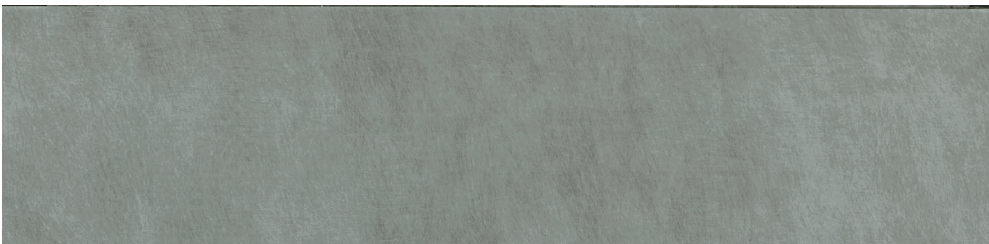
Gris - F7464 - 3+ (Walls) - Stocking