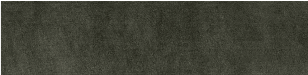
Liquorice - F7465 - 3+ (Walls) - Stocking

*See chart on the next page for further information