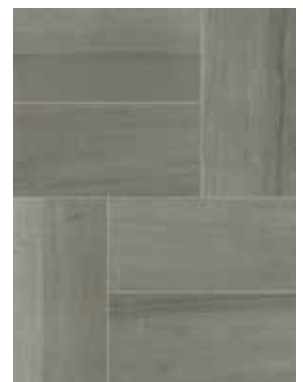
AV305 ▶ Apollo HON