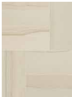
AV303 ▶ Kosmos HON