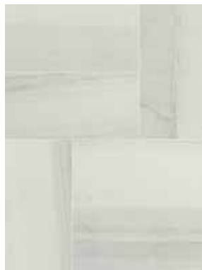
AV302 ▶ Luna HON