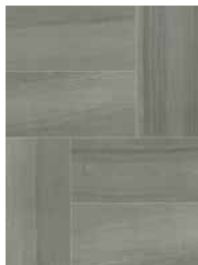
AV305 ▶ Apollo UPS