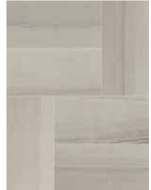
AV304 ▶ Gemini HON