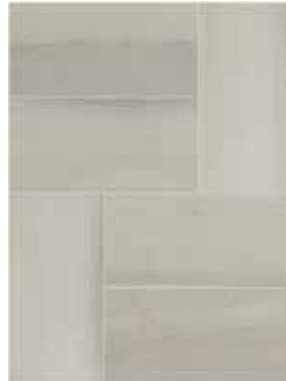
AV304 ▶ Gemini UPS