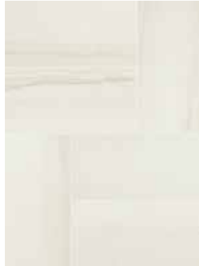
AV301 ▶ Juno HON