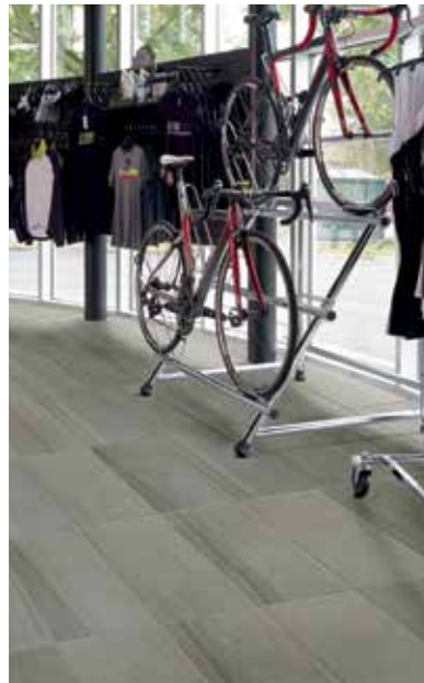
AV305 ▶ Apollo 12 x 24 HON