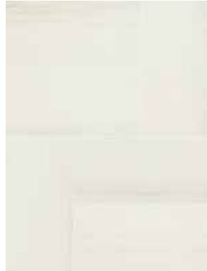
AV301 ▶ Juno UPS