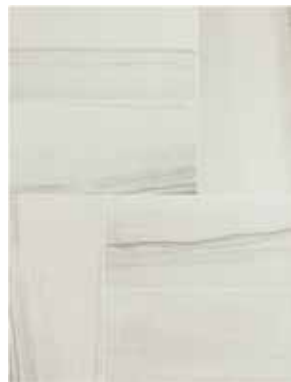
AV302 ▶ Luna UPS