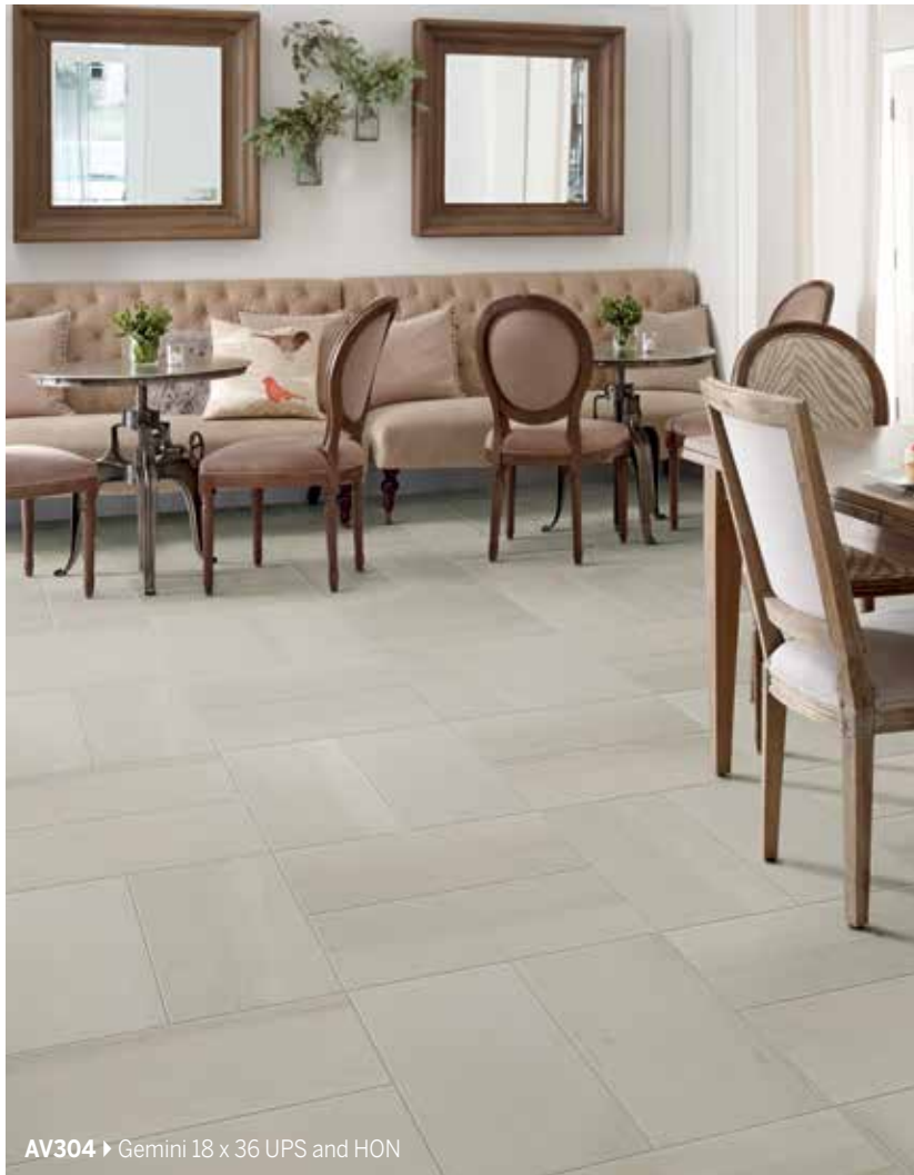
AV304 ▶ Gemini 18 x 36 UPS and HON

Crossville Inc. guarantees that its products will meet or exceed the performance specifications outlined in ANSI A137.1-2022 and in the performance data section of the Crossville, Inc. general product catalog. For complete details check our website at CrossvilleInc.com .