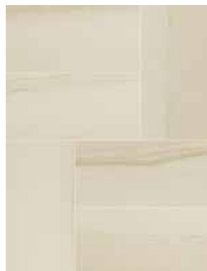
AV303 ▶ Kosmos UPS