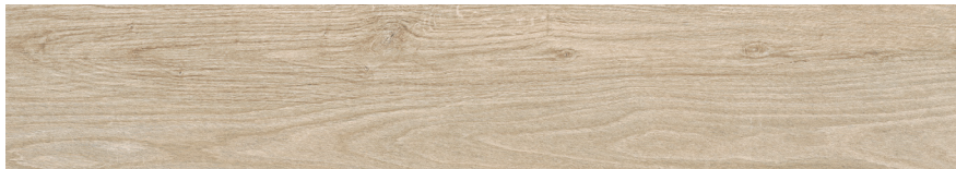
RRLO1 ▶ Daybreak