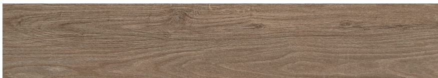
RRLO3 ▶ Midday