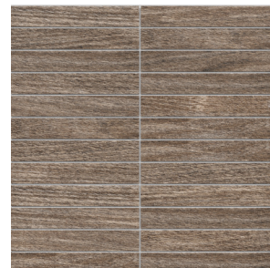
1 x 6 Stacked Mosaics (available in all colors)