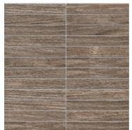
1 x 6 Stacked Mosaic Mounted on a 297 x 290 sheet