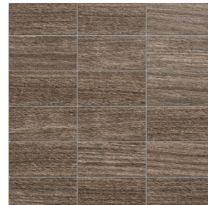
2 x 4 Stacked Mosaics (available in all colors)