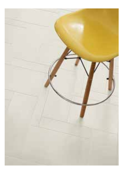
AV311 ▶ Buttoned Up 12 x 24 and 3 x 24 UPS finish