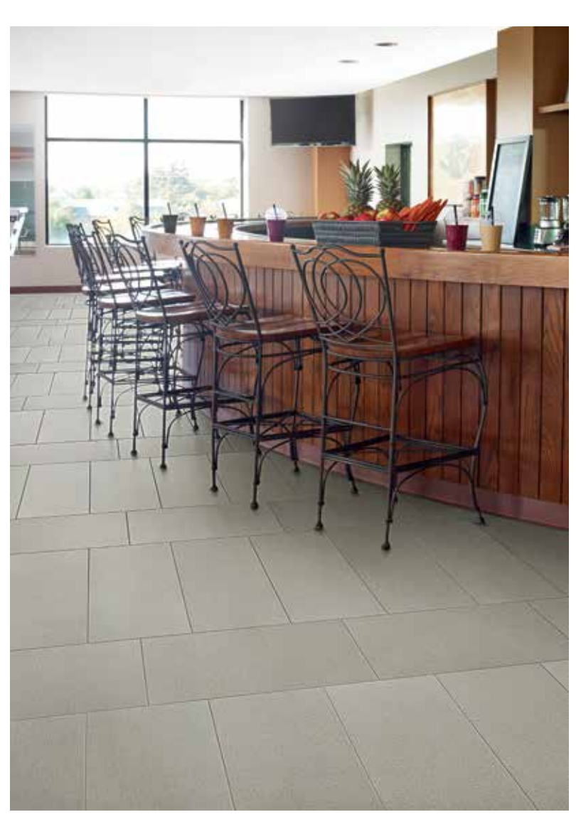
AV317 ▶ Flannel Shirt 12 x 24 UPS finish

Crossville Inc. guarantees that its products will meet or exceed the performance specifications outlined in ANSI A137.1-2022 and in the performance data section of the Crossville, Inc. general product catalog. For complete details check our website at CrossvilleInc.com.