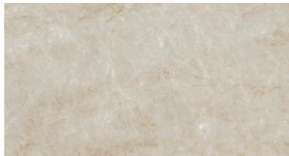
SCL02 ▶ Taj Mahal