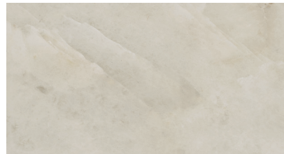
SCL03 ▶ Cristallo