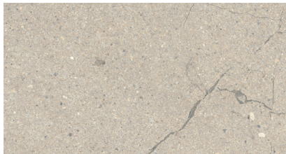
SCL01 ▶ Zecevo