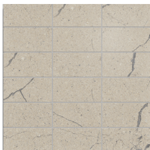
2 x 4 Stacked Mosaics (available in all colors)