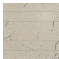
2 x 4 Stacked Mosaic Mounted on a 297 x 297 sheet