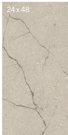
24 x 48