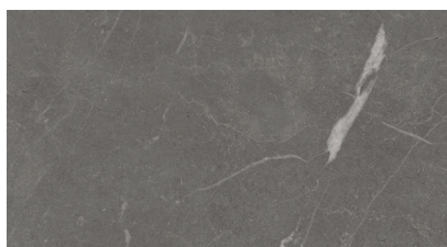
SCL05 ▶ Bronze Amani (FST Only)