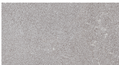
SCL04 ▶ Augustus Grey