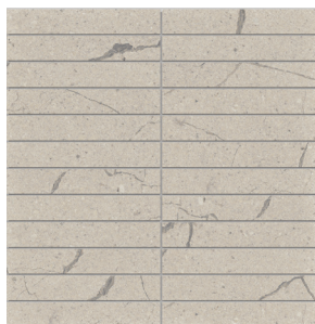
1 x 6 Stacked Mosaics (available in all colors)