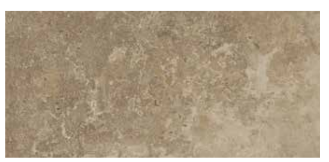
STF04 ▶ Travertine Coffee