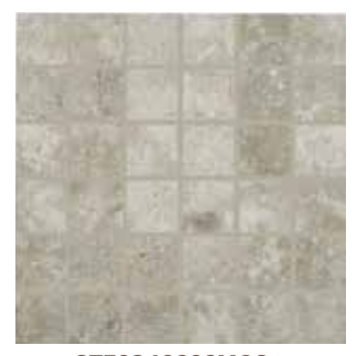
STF03.10202MOS > Travertine Silver 2 x 2 Mosaic