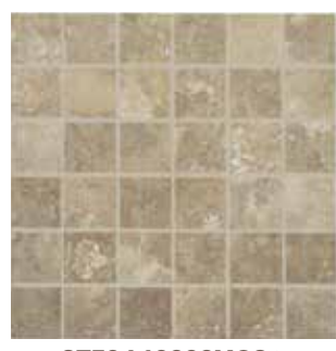
STF04.10202MOS > Travertine Coffee 2 x 2 Mosaic