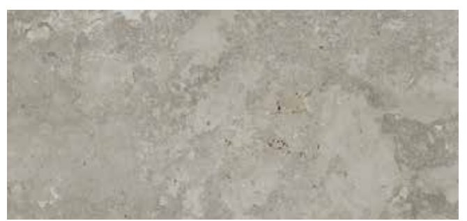
STF03 ▶ Travertine Silver