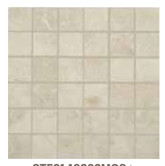
STF01.10202MOS > Travertine Ivory 2 x 2 Mosaic