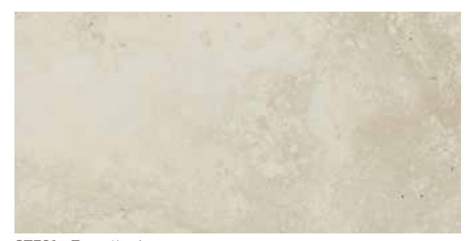
STF01 ▶ Travertine Ivory