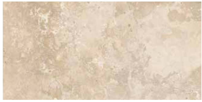
STF02 ▶ Travertine Beige