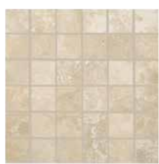
STF02.10202MOS > Travertine Beige 2 x 2 Mosaic