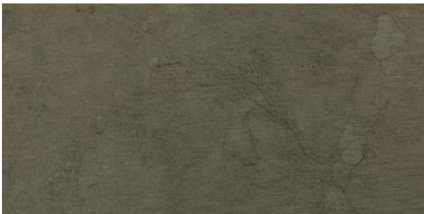
AV325 ▶ Dockside