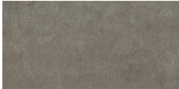
AV324 ▶ Mainline