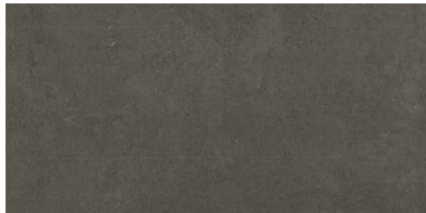
AV326 ▶ Pavement