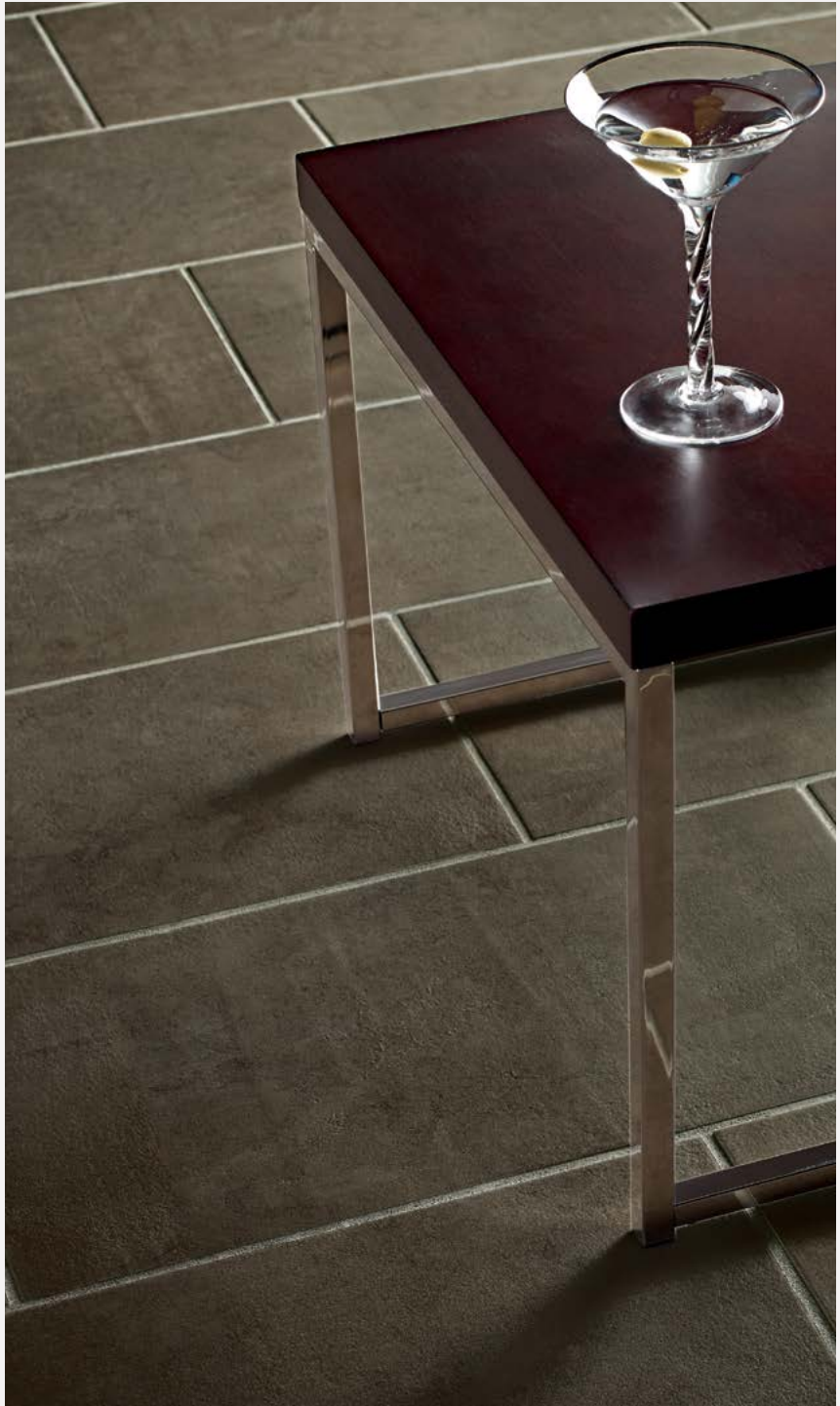
AV325 ▶ Dockside 12 x 24

Each tile color in the Gotham series takes inspiration and its name from iconic cityscapes. Take a bold step out of the shadows just as the sun rises on Gotham. From sidewalk to skyscraper, Gotham has you covered with Crossville's latest porcelain tile.