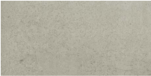
AV323 ▶ Clock Tower