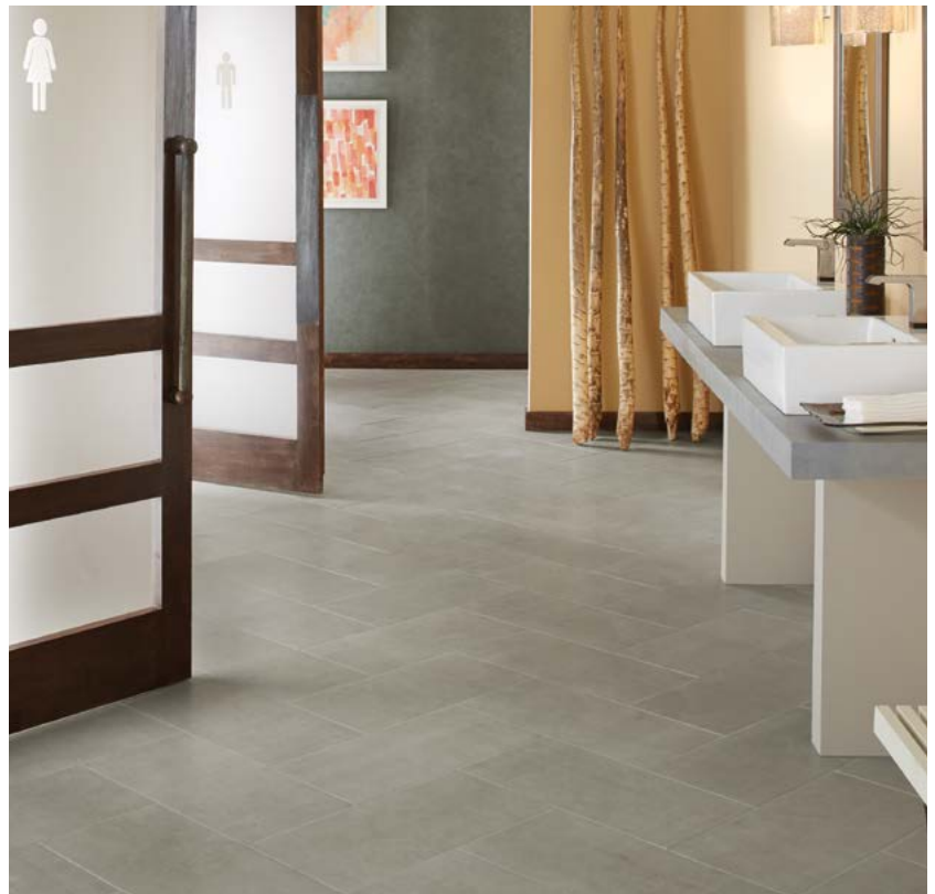
AV323 ▶ Clock Tower 12 x 24