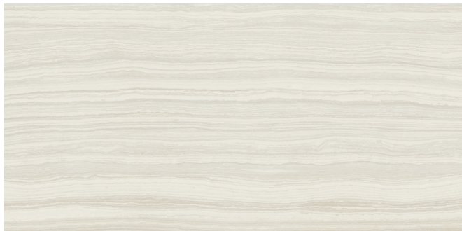
JAV01 ▶ Two Sugars