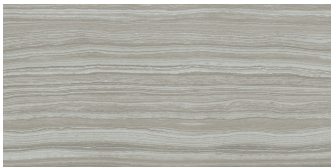
JAV03 ▶ House Blend