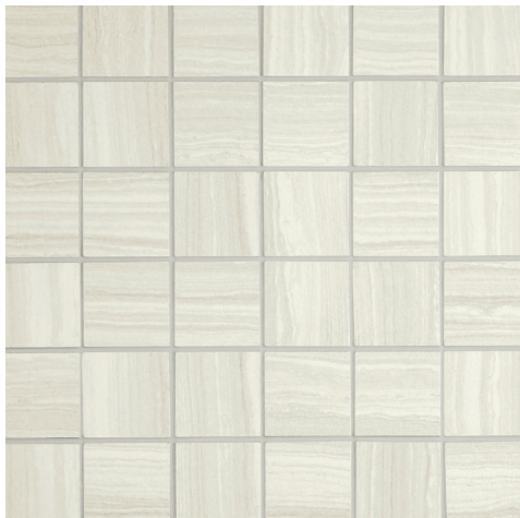
JAV01 ▶ Two Sugars 2 x 2 Mosaics