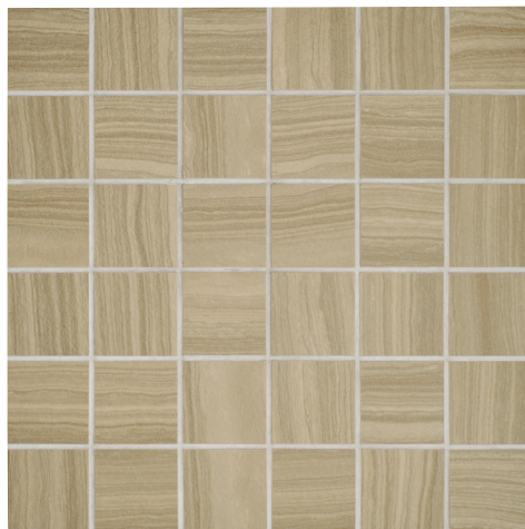
JAV02 ▶ Flat White 2 x 2 Mosaics