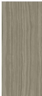
JAV04 ▶ Fresh Ground