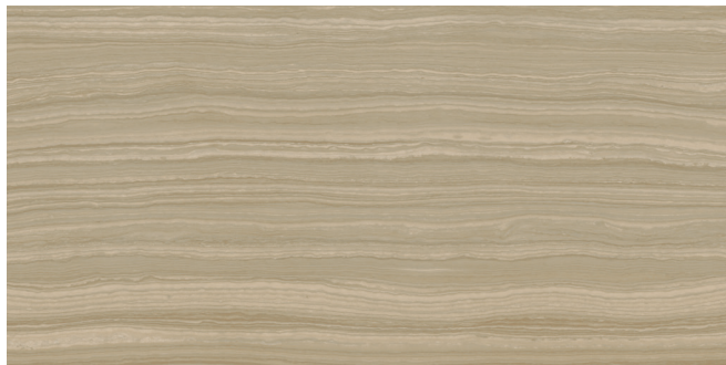
JAV02 ▶ Flat White