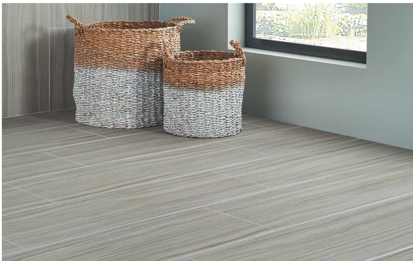
JAV03 ▶ House Blend 12 x 24

Information listed here is subject to change. Please refer to CrossvilleInc.com for the latest, most accurate information.