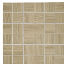
2 x 2 Mosaics UPS Finish (Mounted on an 12 x 12 sheet.)