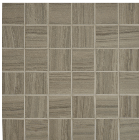
JAV04 ▶ Fresh Ground 2 x 2 Mosaics