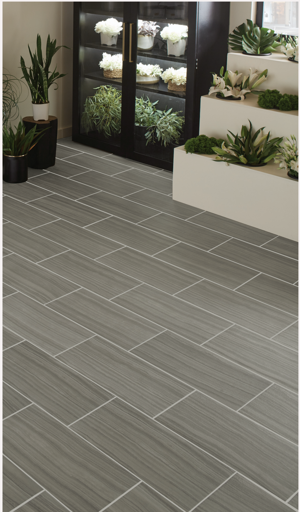
JAV05 ► French Press 12 x 24