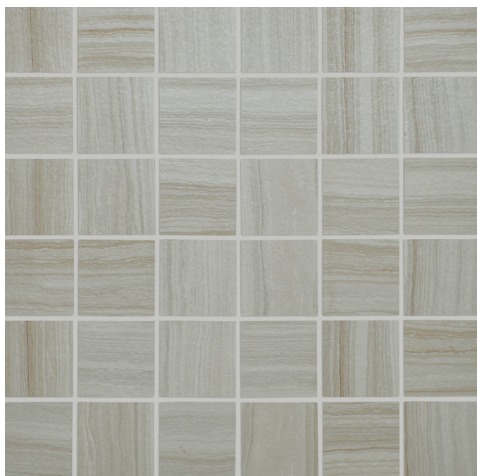
JAV03 ▶ House Blend 2 x 2 Mosaics