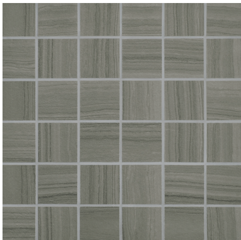
JAV05 ▶ French Press 2 x 2 Mosaics