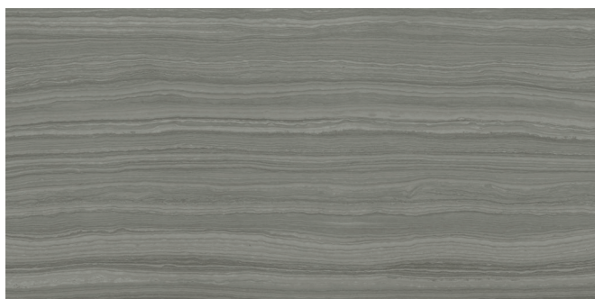
JAV05 ▶ French Press