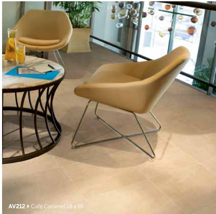
AV212 ▶ Café Caramel 18 x 18

Crossville Inc. guarantees that its products will meet or exceed the performance specifications outlined in ANSI A137.1-2022 and in the performance data section of the Crossville, Inc. general product catalog. For complete details check our website at CrossvilleInc.com .