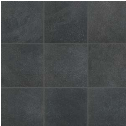
AV215 ▶ Boutique Black