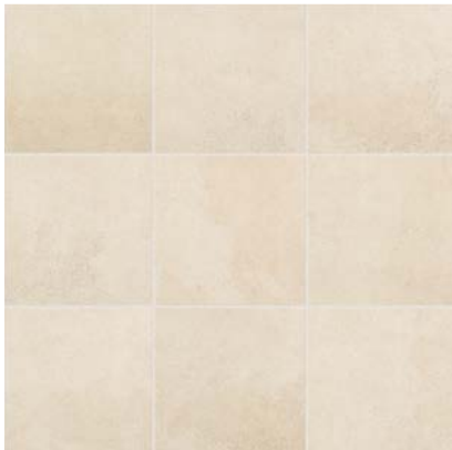
AV211 ▶ Cinema Champagne