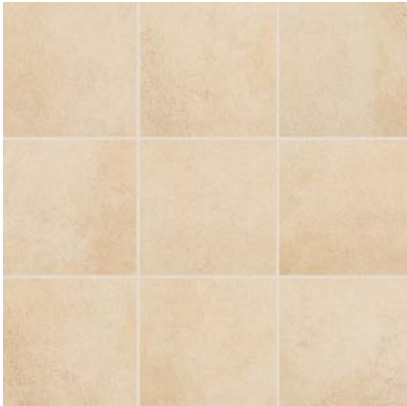
AV212 ▶ Café Caramel