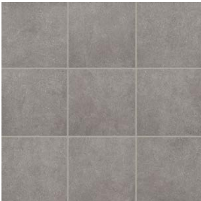
AV214 ▶ Gallery Grey