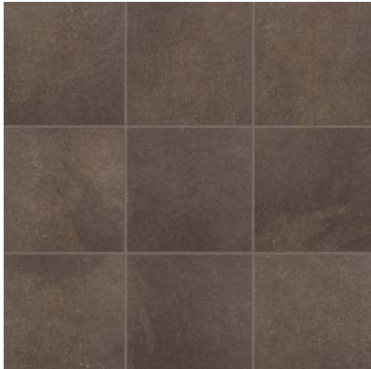
AV213 ▶ Bistro Brown