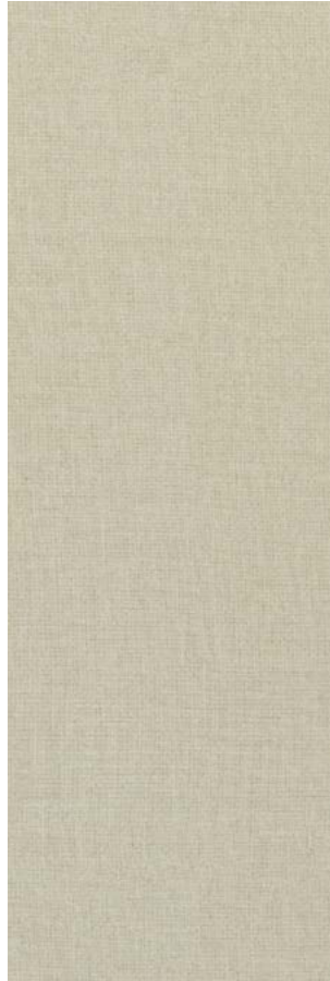
AV313 ▶ Off the Cuff