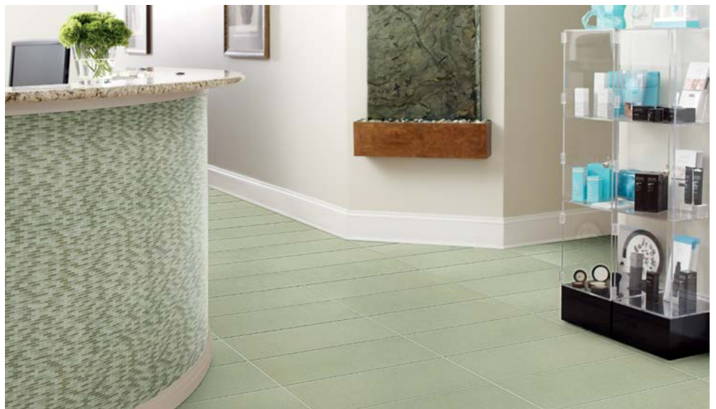
AV315 ▶ Decked Out 12 x 24 UPS, Glass Blox GB12 1/2 x 2 Blend