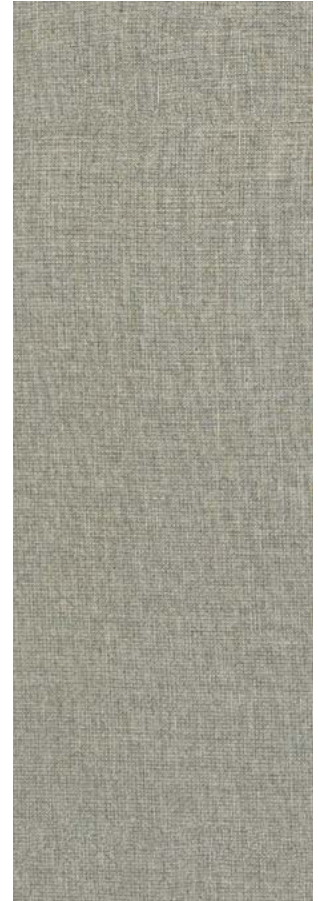
AV317 ▶ Flannel Suit