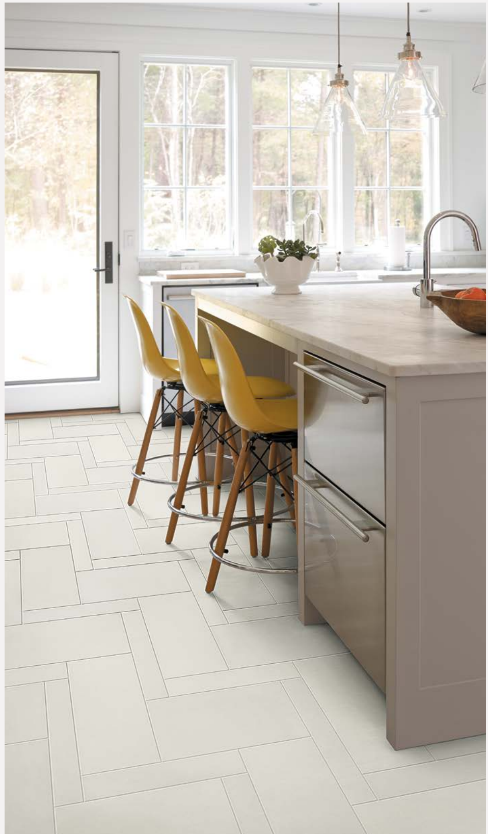
AV311 ▶ Buttoned Up 12 x 24 and 3 x 24 UPS