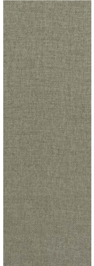
AV318 ▶ Hats Off