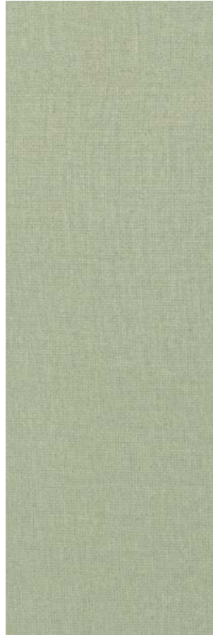
AV315 ▶ Decked Out