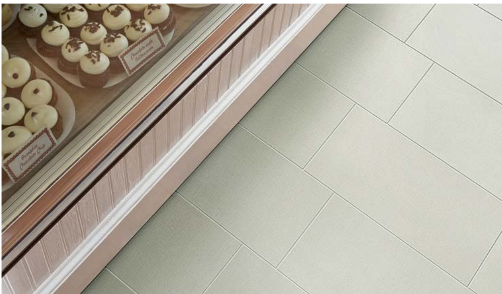
AV312 ▶ Hand in Glove 12 x 24 UPS