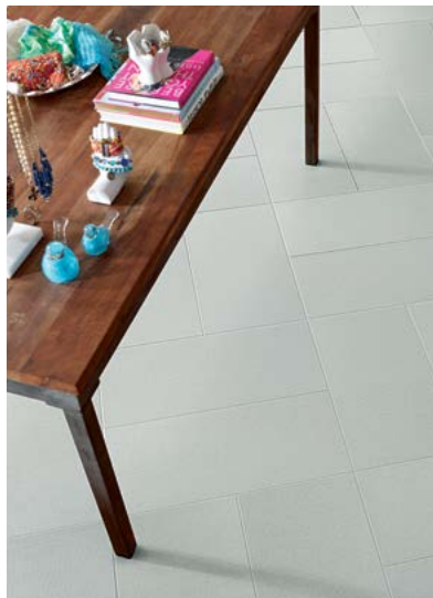
AV314 ▶ Perfect Fit 12 x 24 UPS