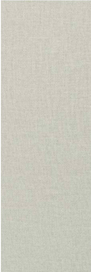
AV312 ▶ Hand in Glove