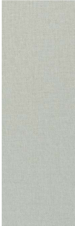
AV314 ▶ Perfect Fit