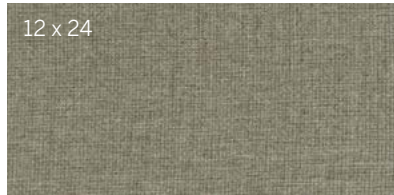
12 x 24