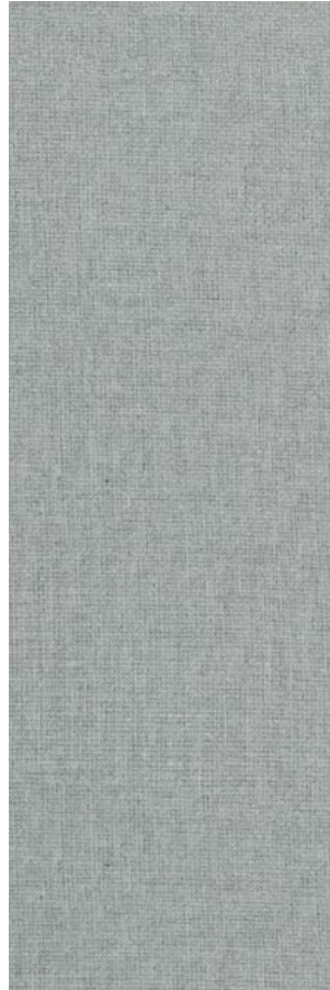
AV316 ▶ Smarty Pants