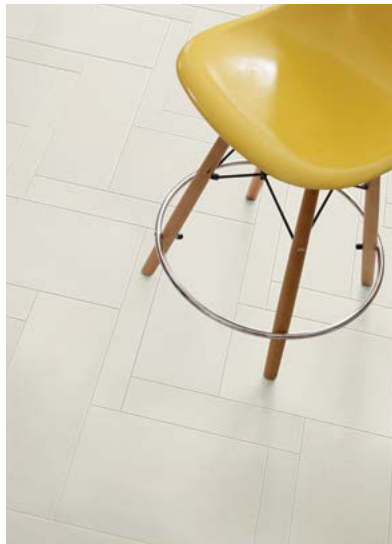
AV311 ▶ Buttoned Up 12 x 24 and 3 x 24 UPS finish