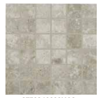
STF03.10202MOS ► Travertine Silver 2 x 2 Mosaic