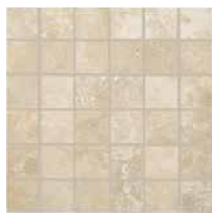
STF02.10202MOS ► Travertine Beige 2 x 2 Mosaic