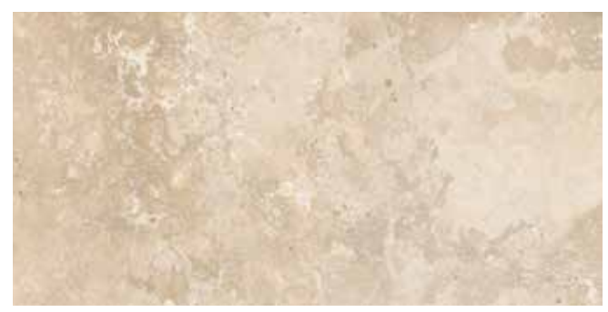
STF02 ▶ Travertine Beige