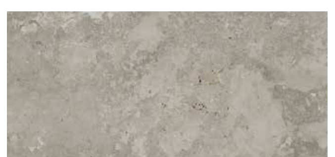
STF03 ▶ Travertine Silver