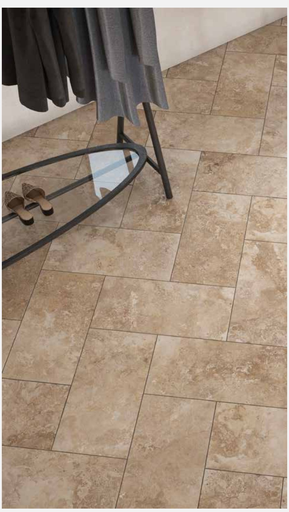
Floor: STF04 ▶ Travertine Coffee 12 x 24 UPS