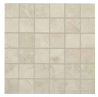
STF01.10202MOS ► Travertine Ivory 2 x 2 Mosaic