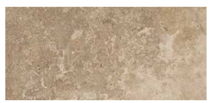
STF04 ▶ Travertine Coffee