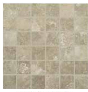
STF04.10202MOS ▶ Travertine Coffee 2 x 2 Mosaic